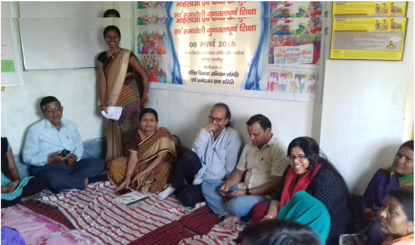
Photograph 6': Gender Campaigns Voices

director of Women's Helpline, appreciated the initiative.