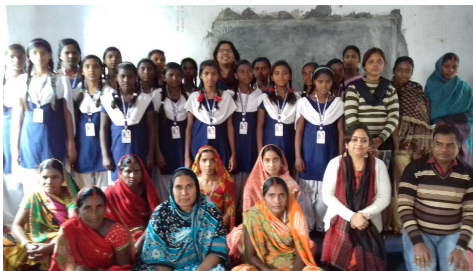
Photograph 1: We the Bal Sansad Children.....and VSS Members Teachers s