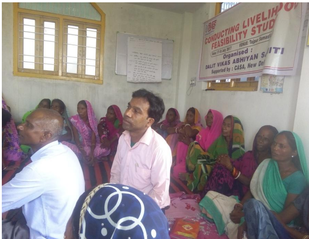
Photograph 5: Participants in Livelihood Training Programme

In its stride towards livelihood empowerment of the target community DVAS has been constantly engaged in sensitizing the community on various aspects of livelihood and also carried out a livelihood analysis of the target area in collaboration with the community. In the reporting year the organisation organised two days training on livelihood feasibility study and livelihood promotion for members of Ambedkar Gram Samiti formed under the project.