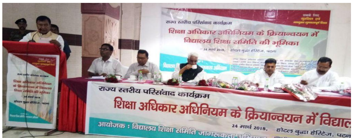
Photograph 4: We Try to Take Policy Makers on Board for a impactful discourse (With Education Minister of Bihar)