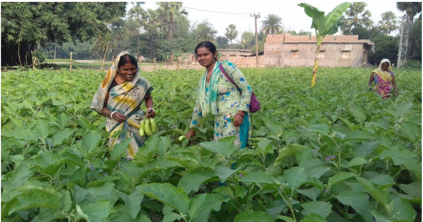
Photographs:7 Community livelihood