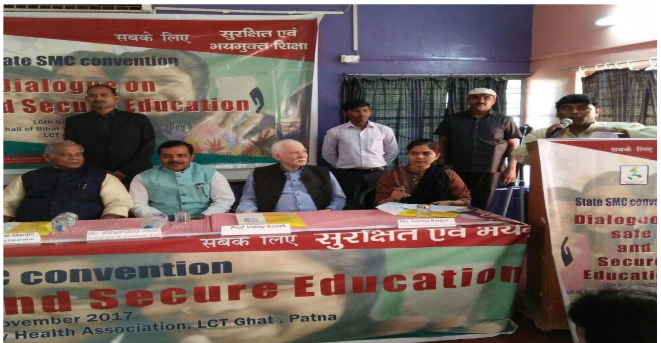
Photographs No 3; Mr jatan Ram Manjhi CM Bihar