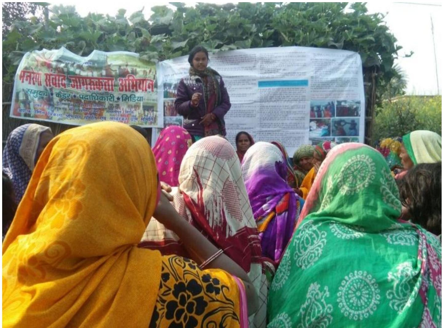
Photograph 4: Campaign on MGNREGA

issue of school was raked up. With the support from local level representatives of RTE forum People were gathered and they submitted an application to cluster education officer of Bodhgaya marking a copy to District Magistrate to organise a school in the vicinity. They got an assurance from the officers and it is believed that the children from this slum will get an opportunity to study in mainstream education system.