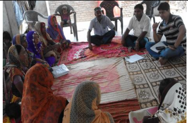
Meeting on CBOs Ramapur maheshpur