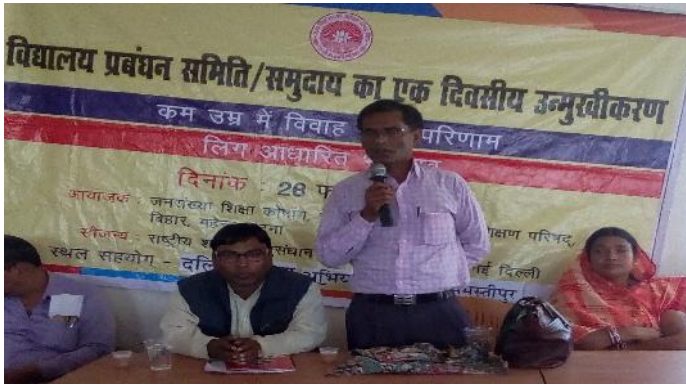
Organised by: DVAS & SCERT-Speach BDO Morwa Block