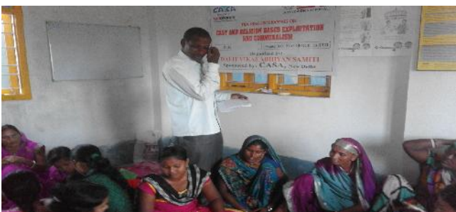
Training on Cast and Religion based exploitation and communalism, & other Activity