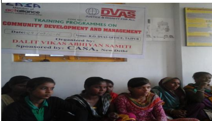
Meeting on Community Development Management