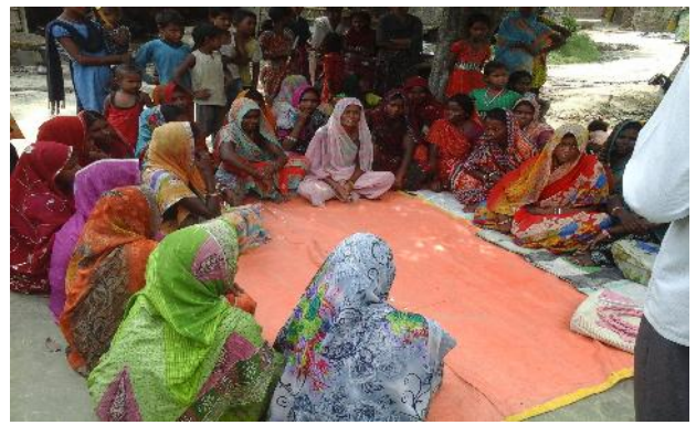
Community Awareness Programme on DVAS