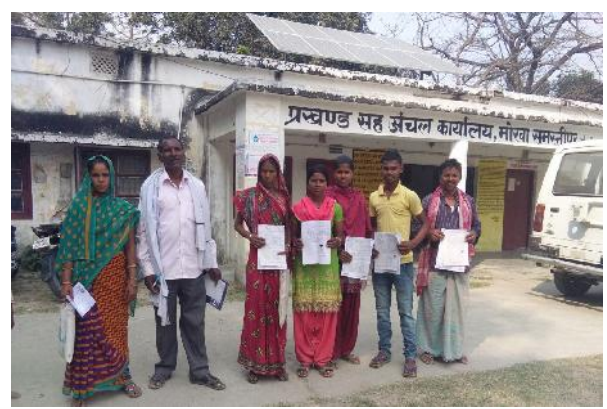
Demand Letter for Landless to Community morwa