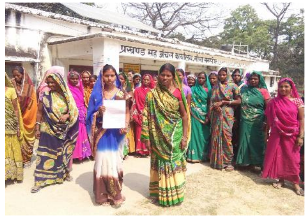
MNREGA Work Demand Letters CBO for BDO Morwa