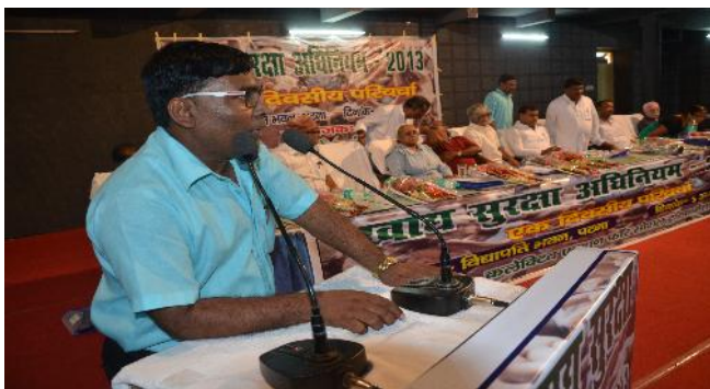
State level conference on righte to food