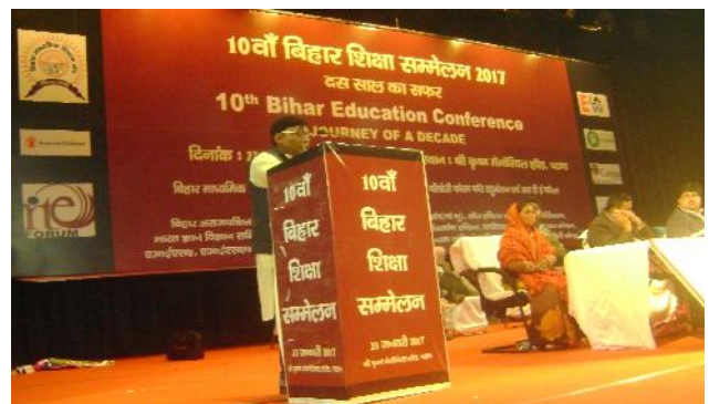
State Level Education Conference 2017