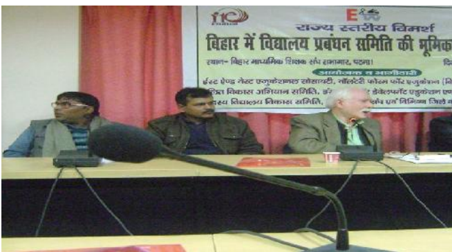
Meeting on SMC and Formation to SMC Fedretion