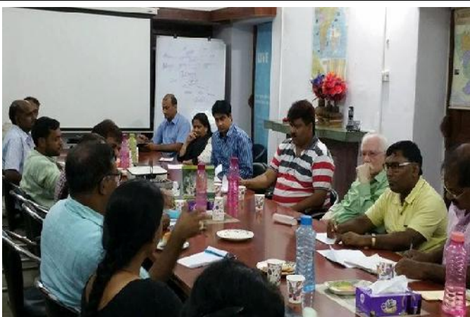
Meeting on VFE & RTE Forum, Bihar Chapt'r