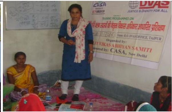
Gendres Training Programme for CBOs