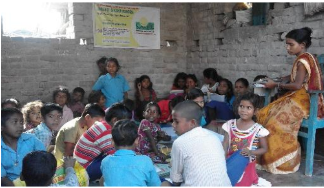
Education Centre for DVAS