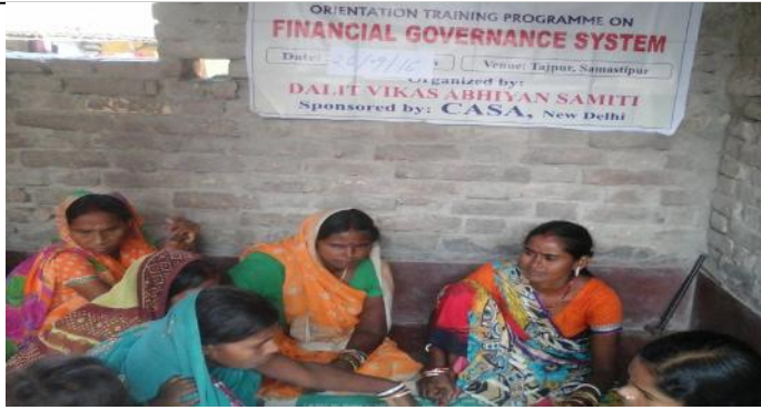
The Meeting on Financial Governance System