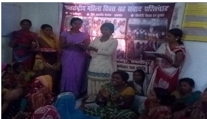
Womens Day Programmes for CBOs