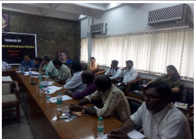
Meeting on Safe and Secure Education