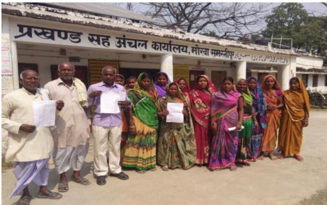
CBOs Demand letter for Landless-CO Morwa Circle