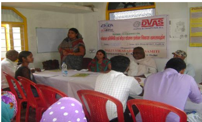
The Meeting on PRI and Community leader