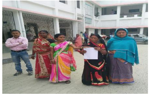
Demand Letter CBOs Leader for DM Samastipur