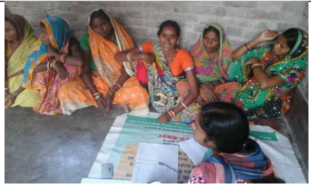
Group Disction CBOs on Micro Budgeting