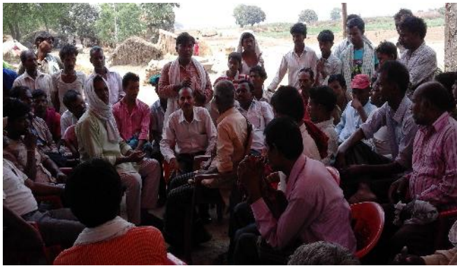
Panchayat election Awareness Programmes on Mahadalit Community for DVAS