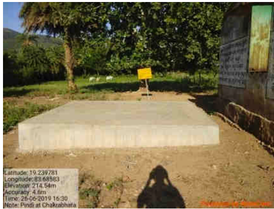
Fig: Pindi at Chakrabhatta village