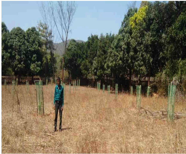
Fig: WADI Plantation at Kisankebidi