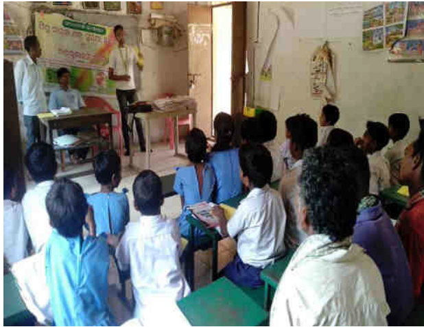
Fig: Awareness at school