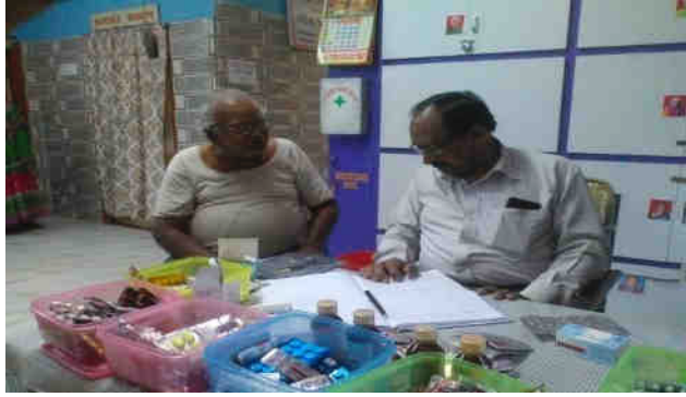
Fig: Regular Health Check up at Senior Citizens' Home