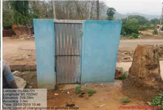
Fig: Changing Room at Goranda village