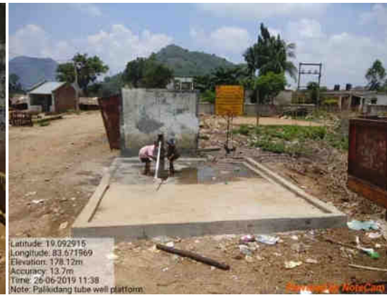
Fig: Tubewell Platform at Palikidanga village