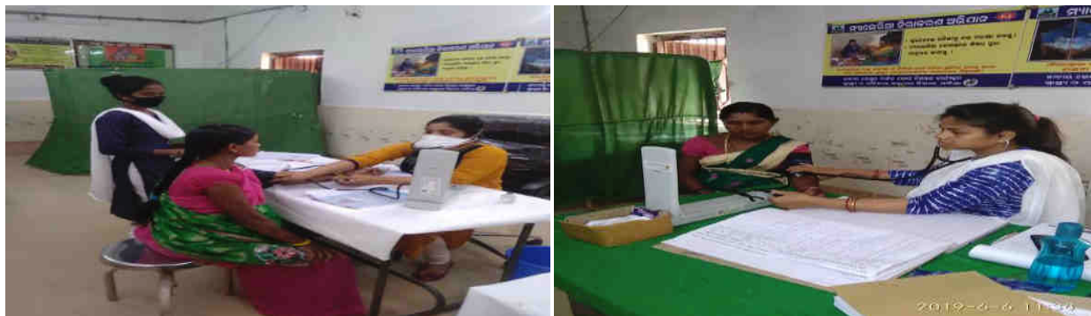
Fig: Regular Health Check Up at CHC, Kashipur facilitated by staffs of MWH