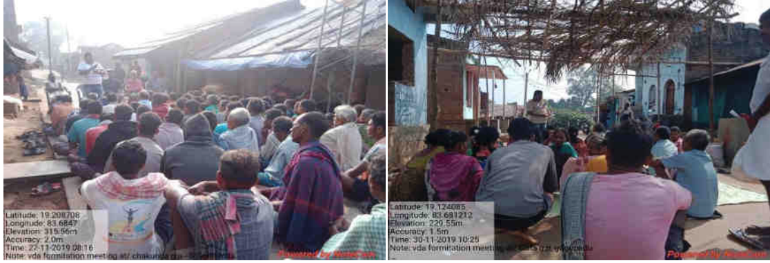
Fig: Meetings on formation of VDA