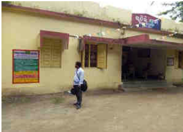
Fig: Childline wall message at Police Station