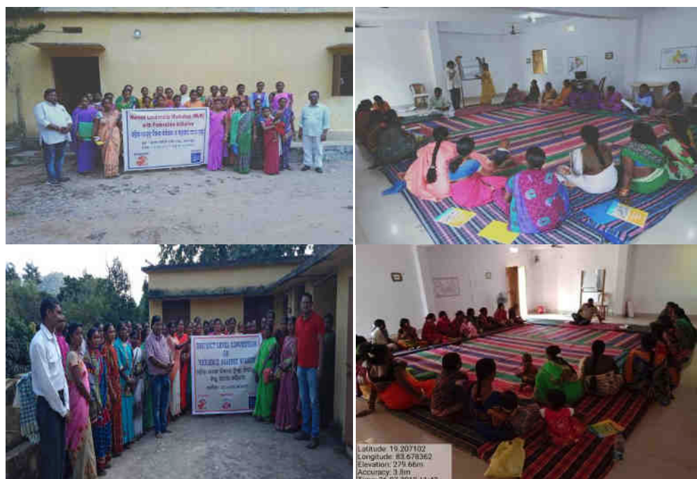
Fig: Different Programmes of 'The Hunger Project'