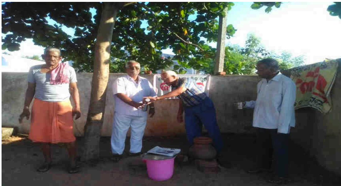
Fig: Water distribution during summer by inmates of Senior Citizens' Home