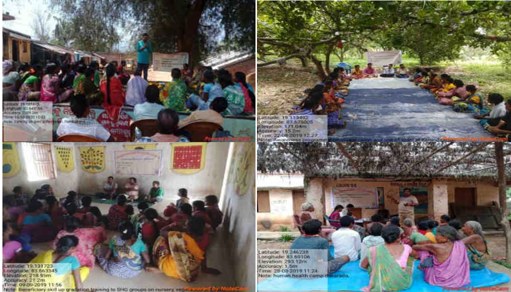
Fig: Different Capacity Building Programmes at OTELP PLUS Area, Ramanaguda