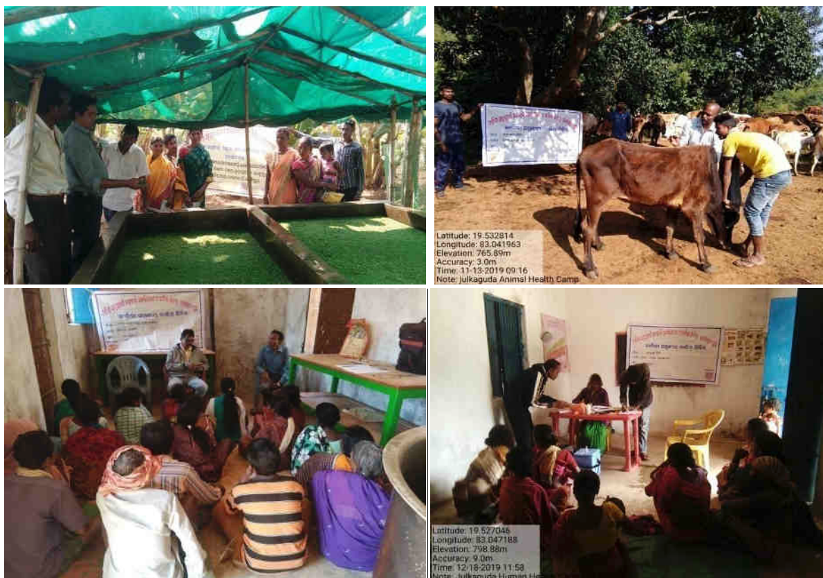
Fig:- Different Capacity Building Programmes of OTELP PLUS, Kashipur during FY 2019-20