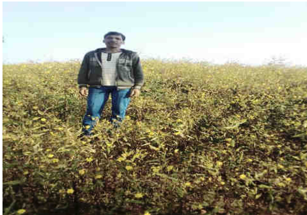
Fig: Niger Demonstration at Adajore village