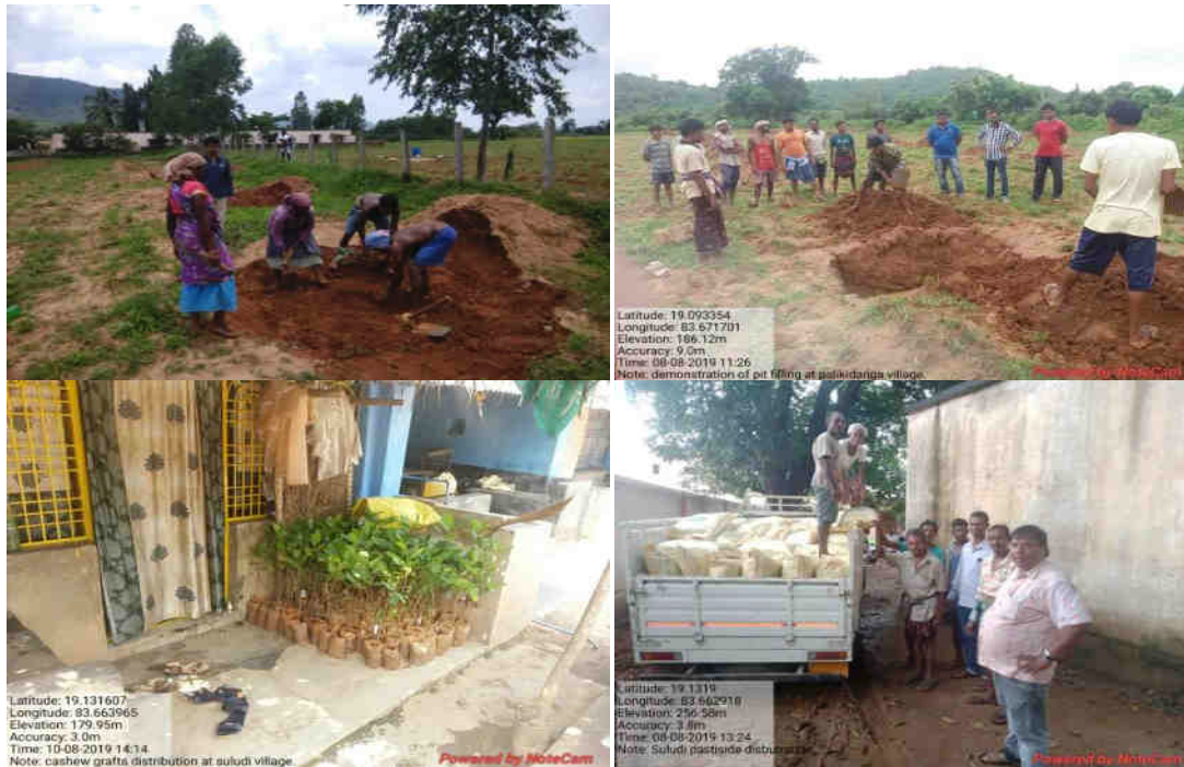
Fig: Support for WADI Plantation by SHAKTI-OTELP PLUS, Ramanaguda