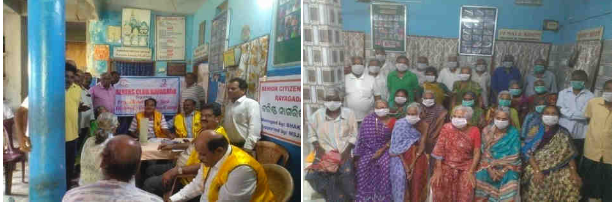
Fig: Awareness Camp on Health issues at SCH Fig: Use of Mask by inmates of SCH to prevent corona