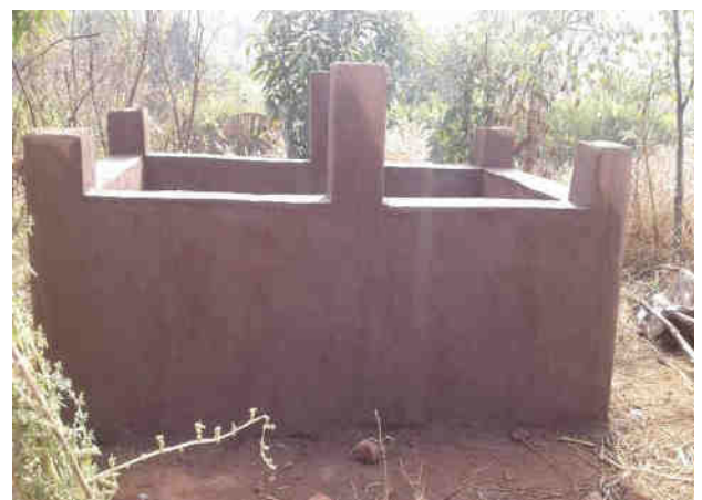
Fig: Compost pit at Pipalpadar