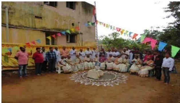
Fig: Celebration of Independence Day