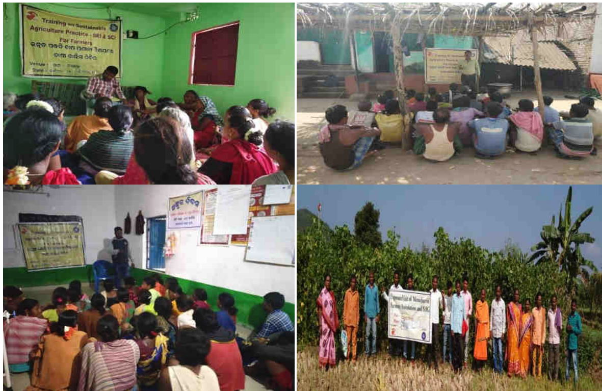
Fig: Capacity Building Programmes conducted by SHAKTI-CWS