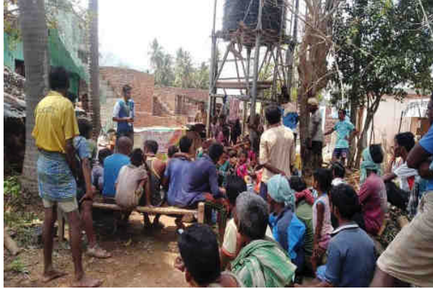
Fig: Awareness to villagers