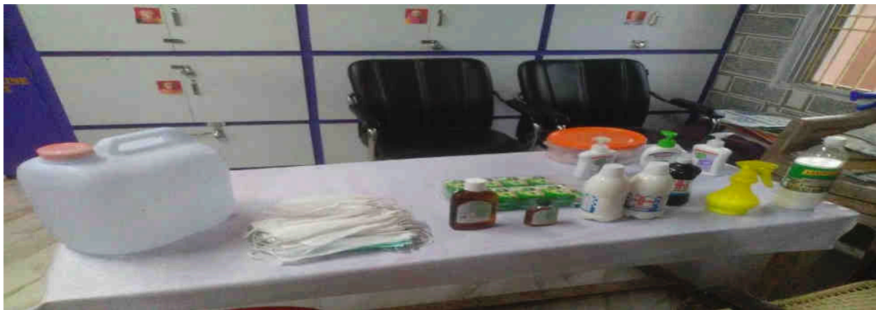
Fig: Distribution of mask, sanitizers at Senior Citizens' Home including awareness on use by inmates to get rid of corona as preventive measures