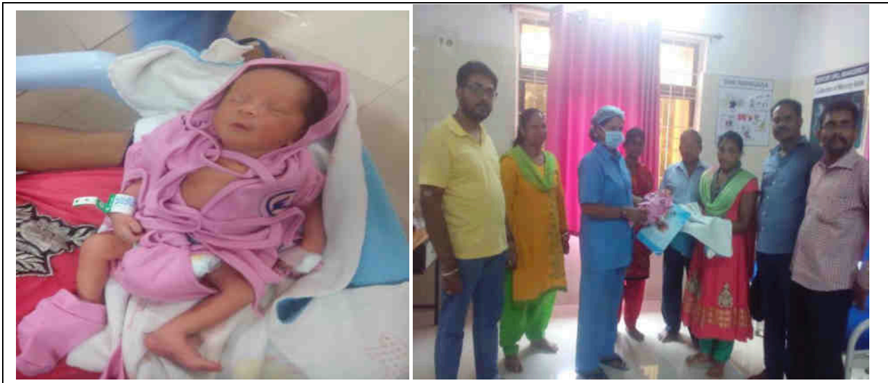
At-District head quarter Rayagada

An unmarried female of village Debdola, Po-Kumtelpetha, Ps-Chandili, Block/District-Rayagada involving with love affair has given birth to a male child at District Head quarter Hospital, Rayagada. She belongs to general caste and used to work as daily wage labour due to poor financial condition of her family. After getting phone call from DCPO, Rayagada, Childline, Rayagada intervened in the case, counseled the mother of the child and came to know that in fear of social shame and stigma because of unmarried birth case she was not interested to take the child at home and interested to surrender the child to Government. Through facilitation of Childline team the child was received by Government and handed over to Special Adoption Agency (SAA), Koraput. The female including her family expressed their gratitude and thanks to Childline, Rayagada for such cooperation and solving the case.