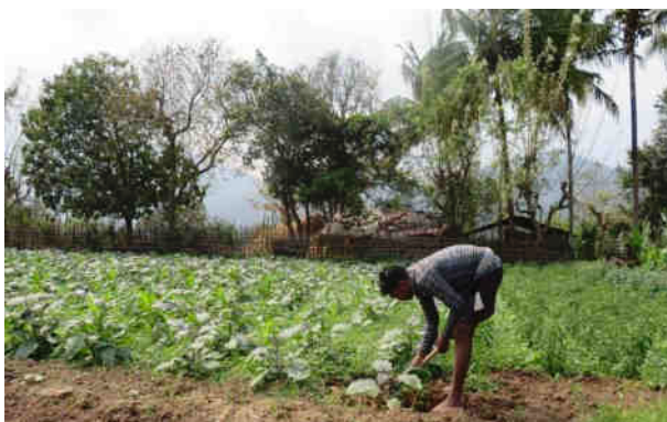
Fig: Seedling distribution and cultivation supported by SHAKTI-CWS