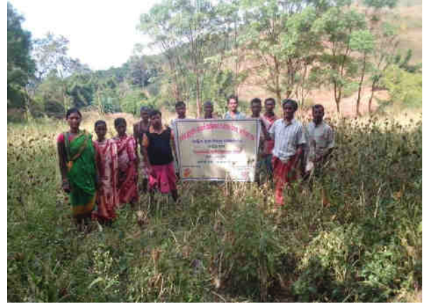
Fig: Ragi cultivation at Kantamal village