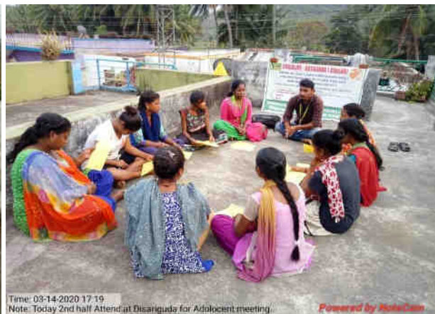
Fig: Adolescent girls meeting