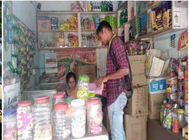
Fig: Outreach with Shopkeeper