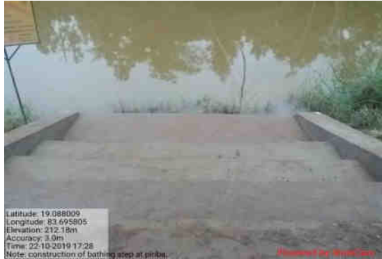
Fig: Bathing step at Piriba village