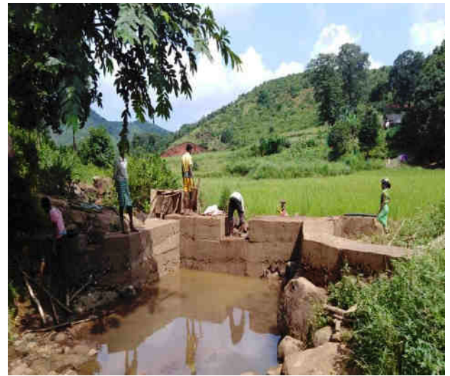
Fig: Check dam at Jhulkaguda