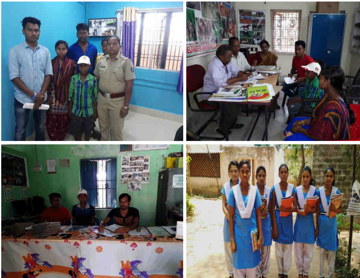
Fig: Stages of rehabilitation up to continuity of education facilitated by Childline, Rayagada

After getting phone call from Gunupur police station, childline team, Rayagada intervened in the case and came to know that the victims are poor scheduled tribes and there is need of shelter, nutrition, safety and proper education to the distressed children. Childline, Rayagada received the children, counseled them to get rid of mental stress, prepared the required documents and report to produce before CWC, Rayagada along with proper communication to DCPU, Rayagada. At last Childline team, Rayagada succeeded in providing shelter, safety and education to the children channelized through CWC and DCPU, Rayagada. The female child was sheltered at SEVA SAMAJ (CCI) and continued her education at Municipality high school, Rayagada where as the male child was sheltered at Balniketan Gunupur (CCI) and continued his education at Gunupur High School. The children and their well wishers became thankful to Childline, Rayagada for timely action and proper rehabilitation.