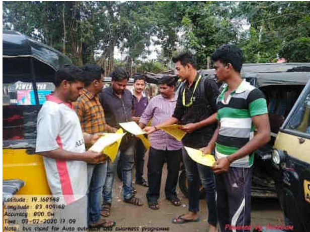
Fig: Outreach with Auto Drivers