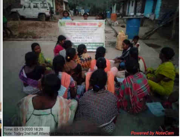
Fig: Sensitization Programme on adolescent girls Fig: Outreach with SHG functionalities