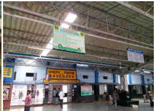
Fig: Childline hoarding at Railway Station