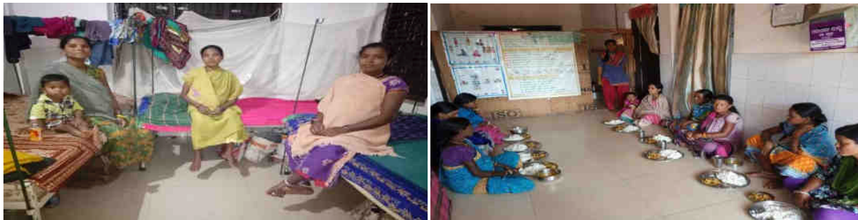
Fig: Free lodging and food facility at MWH, Kashipur