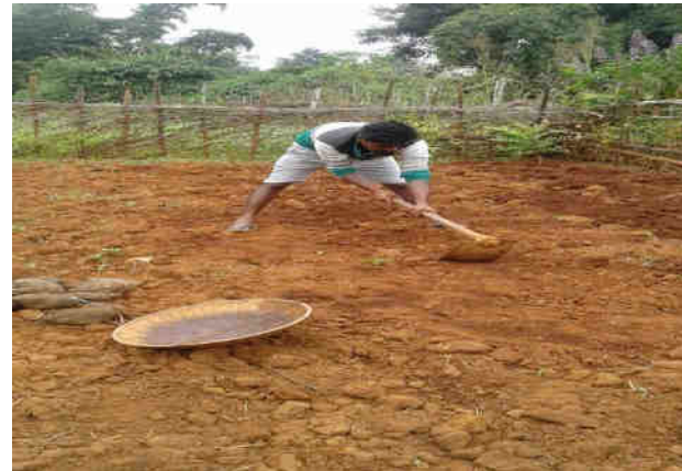
Fig: Yam cultivation at Sindurghati village