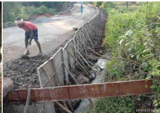
Fig: Guard Wall at Kariniguda village