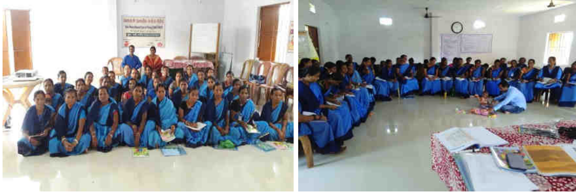
Fig: Asha trainings at SRDTC, Ramnaguda

Anganwadi workers participated from 4 Blocks of Rayagada District such as Muniguda, Rayagada, Kolnara, Bisamkataka. Similarly total 16 nos. of 5 days Asha training conducted at the training centre where 511 nos. of Asha participated from 5 Blocks of Rayagada District such as Rayagada, Muniguda, Gunupur, Kolnara, Kalyansingpur. In this way total 35 nos. of training programmes conducted at the SRDTC during FY 2019-20 where total 1128 Asha and Anganwadi workers participated from 6 Blocks of Rayagada District. Along with fooding facility the participants were provided travel allowance for participating at the training programme. Both trainer and trainees were also provided with necessary well accommodation facilities at the SRDTC premises. Master Trainers from District Hospital participated as Resource Persons.