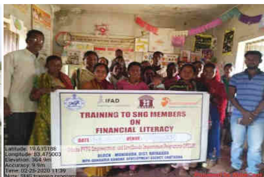
Fig: Capacity Building Programmes in Muniguda Cluster