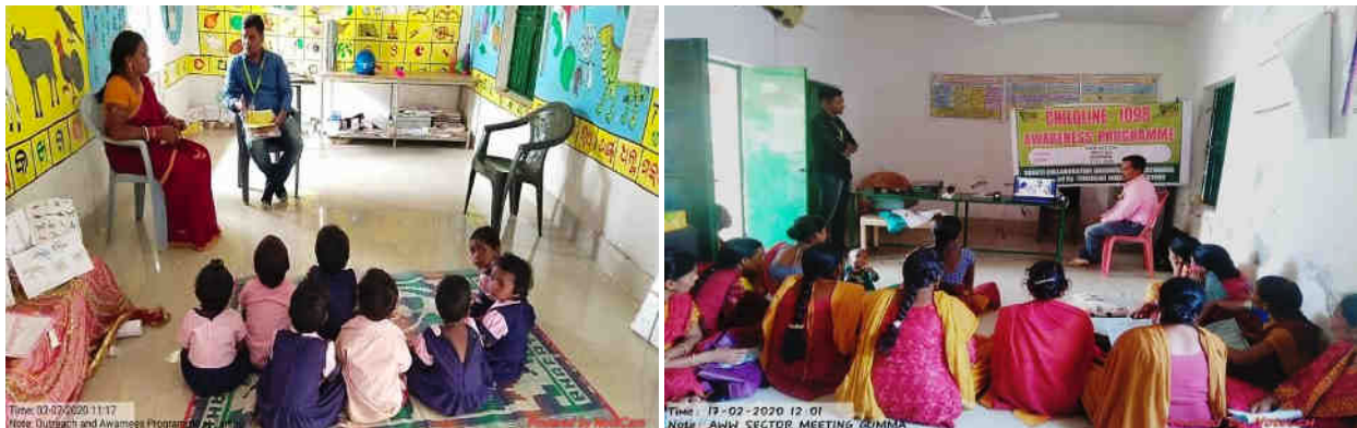
Fig: Outreach at Anganwadi Centers