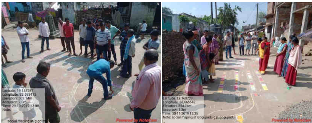
Fig: Village Resource Mapping during VDLP Preparation