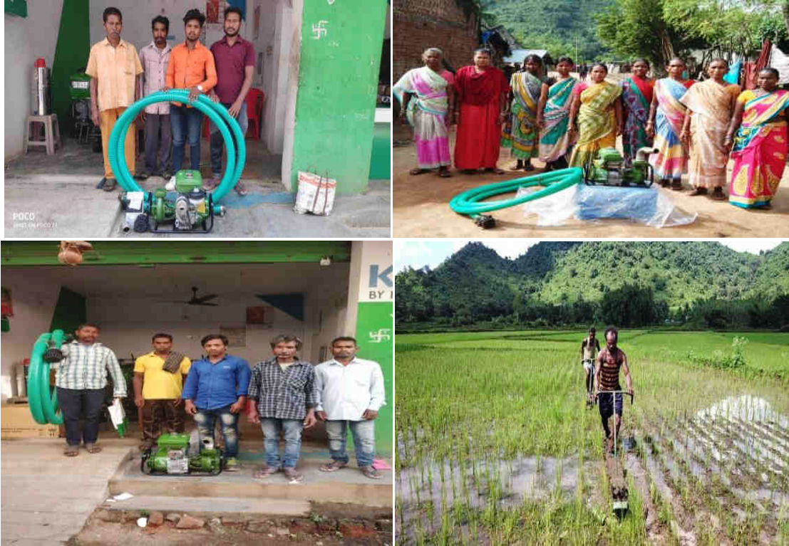
Fig: Support of agro inputs by SHAKTI-CWS