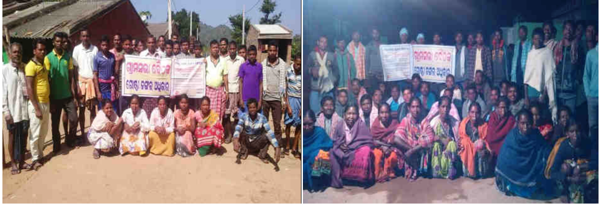
Fig: Community Forest Right Committees