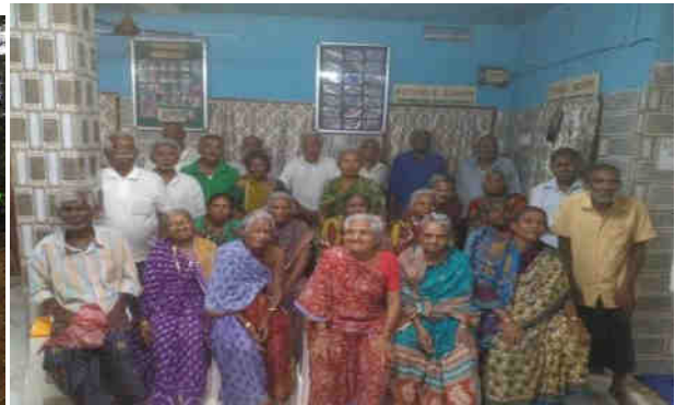
Fig: Group photo of Senior Citizens at SCH