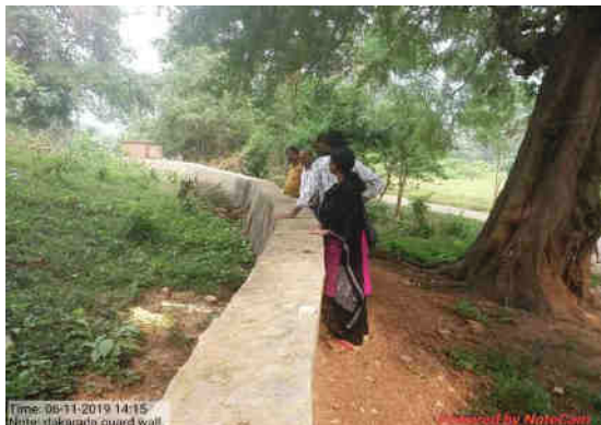
Fig: Guard Wall at Dakarada village