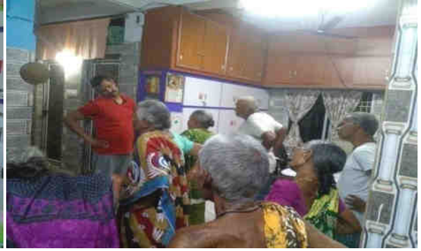
Fig: Yoga Practice at Senior Citizens' Home