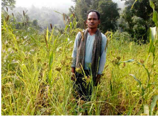
Fig: Ragi cultivation at Musatakiri village