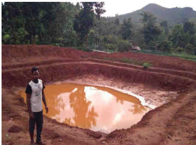
Fig: Farm Pond at Adajore